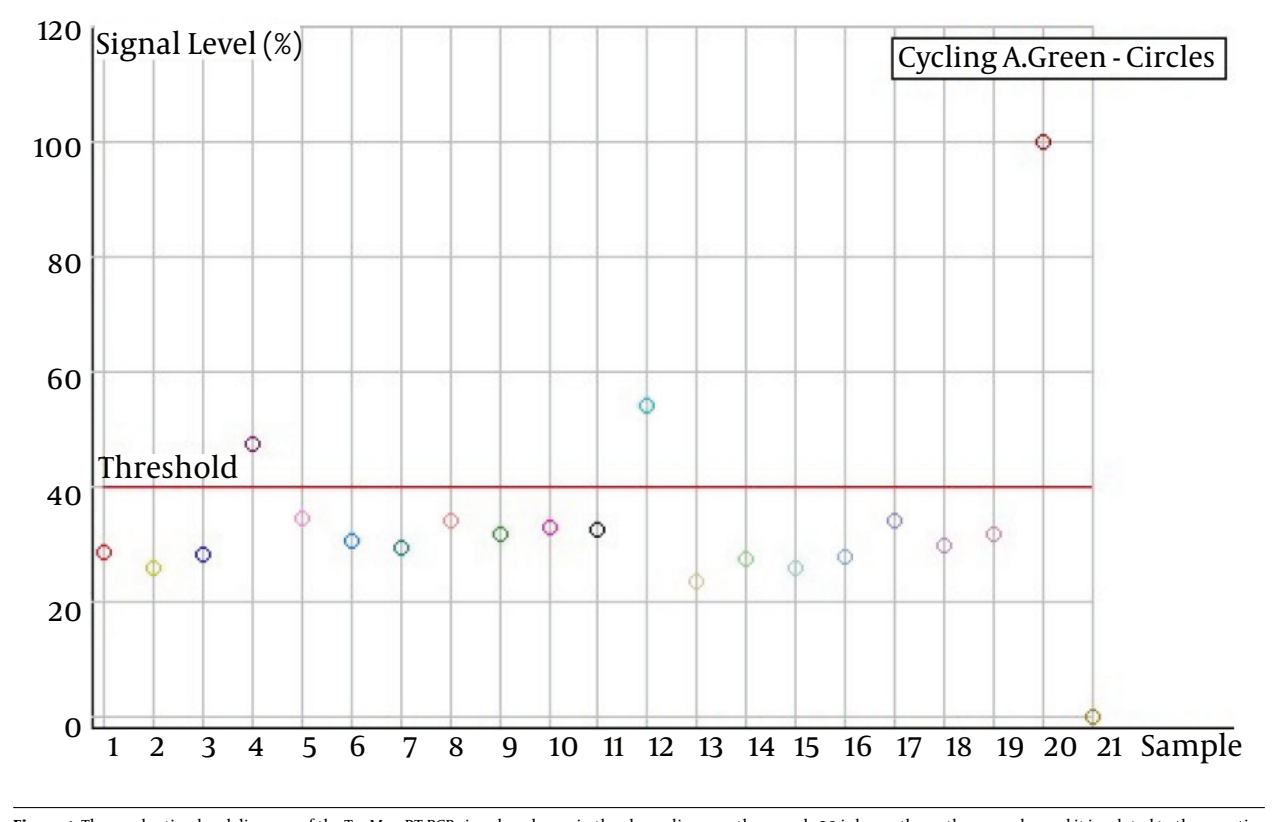
Figure 1. The production level diagram of the TaqMan RT-PCR signal; asshown in the above diagram, the sample 20 is lower than other samples and it is related to the negative control; and sample 20, which is higher than the other samples is positive control, The samples of 4 and 12 samples are not HTLV-1-infected and other samples are infected with HTLV-1.