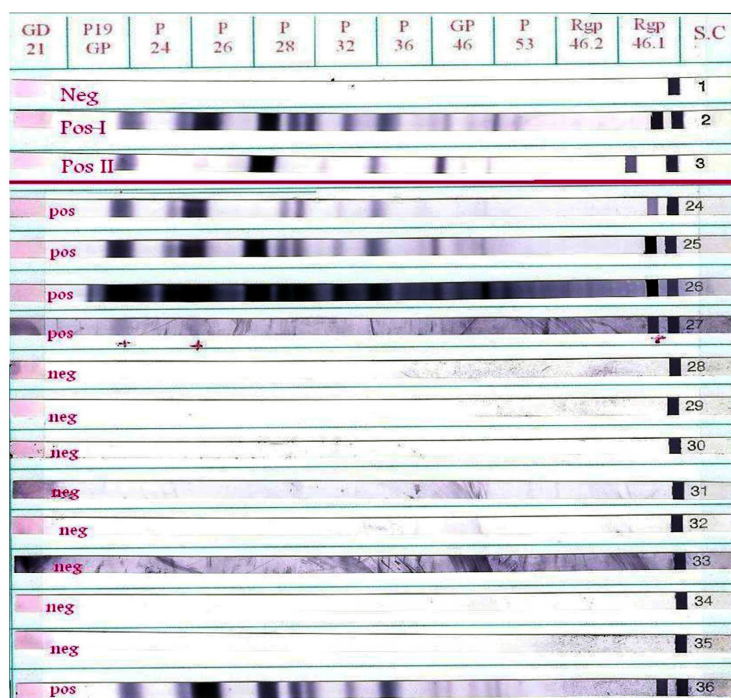
Figure 1. Results of Western blotting in thalassemic patients. Strip1: Negative control, Strip2: HTLV-I positive control, Strip3: HTLV-II positive control. Other strips: Tested sera. No reaction with HTLV specific proteins indicates seronegativity. Reaction with GAG (p19 with or without p24) and two ENV proteins (GD21 and rgp46-I) indicates HTLV-I seropositivity and reaction with GAG (p24 with or without p19) and two ENV (GD21 and rgp46-II) indicates HTLV-II seropositivity.

The human T-cell lymphotropic virus type I (HTLV-I) is the first retrovirus identified in humans. It has been responsible for a number of clinical syndromes, most notably adult T-cell leukemia or lymphoma (ATL). Understanding the epidemiology and clinical manifestations of this virus is necessary to properly diagnose and care for patients with HTLV-I infection. 1 There is no defined treatment for patients infected with HTLV-I, but the accurate knowledge of seroprevalence rates in different population groups may be helpful in establishing prophylactic measures to reduce rates of viral transmission from infected individuals. This infection is endemic in certain parts of the world as well as in a northern city of Iran, Mashhad. 10,11,13 A nation-wide sero-epidemiologic survey of adult T-cell leukemia virus (HTLV) has been performed in Japan. Sera from adult donors in 15 different locations were screened for anti-ATL. High incidences (6 to 37%) of antibody-positive donors